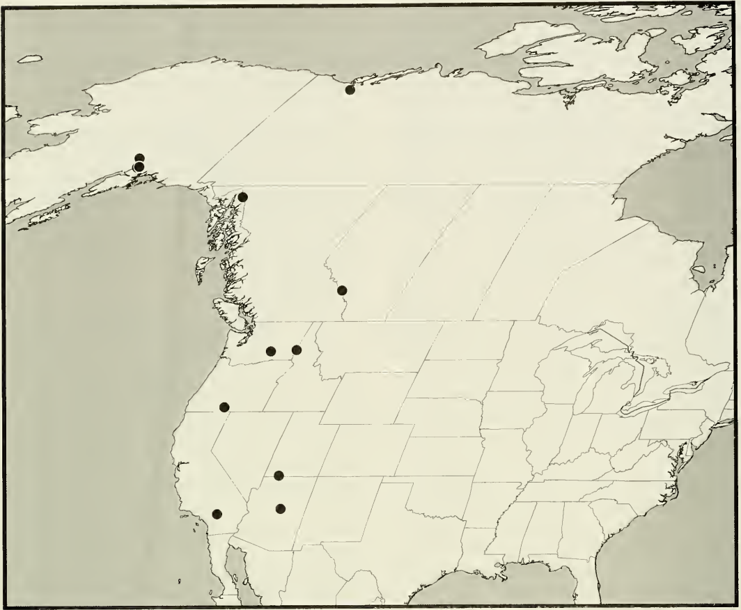
Fig. 7. Distribution map for Philygria nigrescens .

OREGON. Lake: Quartz Mountain ( 42^{\circ}19.3'N , 120^{\circ}48.9'W ; 1,600 m), 14 Jun 1984, R. Danielsson (1 ♀; ZIL).